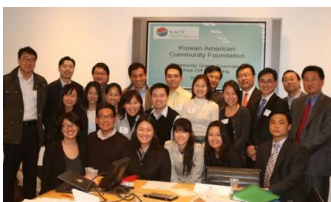
2009 Community Grants Committee—KACF is now accepting applications for the CGC!

KACF now taking grant applications for 2010!